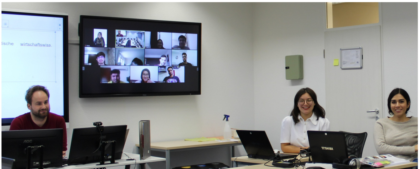
A hybrid classroom (at IIK Berlin)