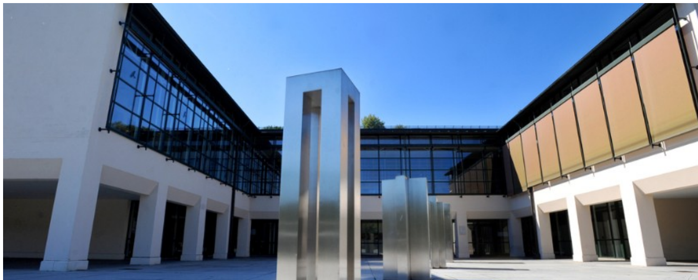
View of the main entrance of the central library